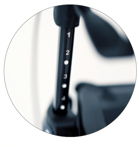
Numeric scale enables user friendly height adjustment of the handles.

Safety, high durability, a patent-pending brake and various sophisticated functions are notable features of the TOPRO Pegasus. The modern, slender and lightweight design makes it unique.